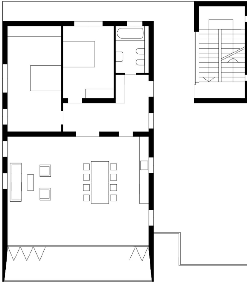
Third-floor plan drawing.