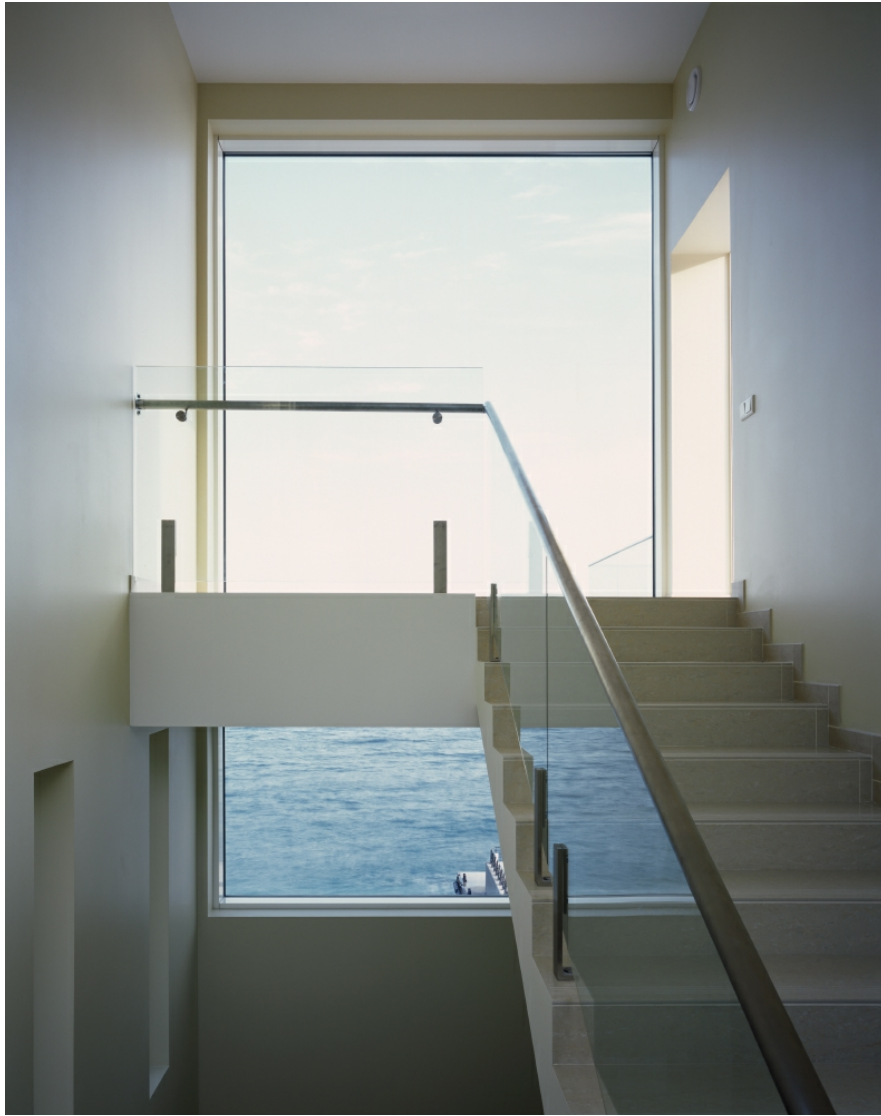
Interior staircase.