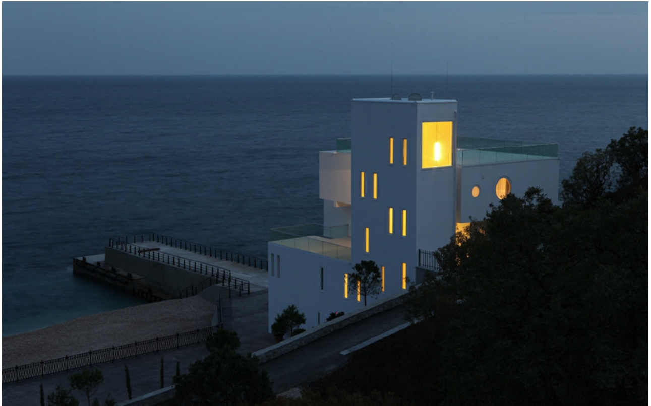
View from the uphill slope.