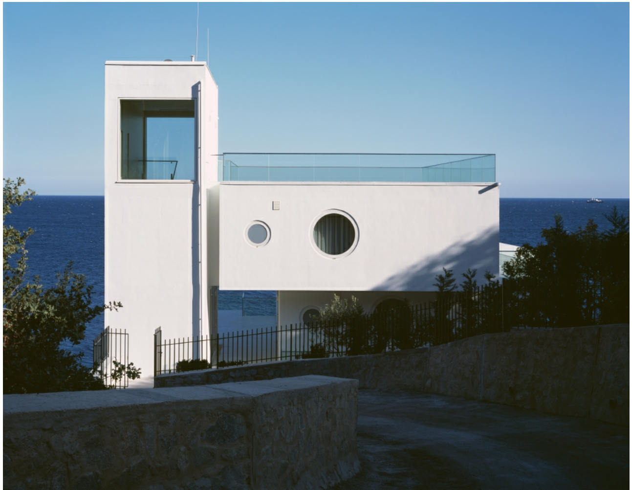
Rear view.

The design is anchored by the yacht room, connected to the water by a railed slipway. Balancing the visual weight of the double-height ground level, a series of three distinct volumes are stacked above, with extensive views from indoor spaces and generous balconies outfitted with glass railings.