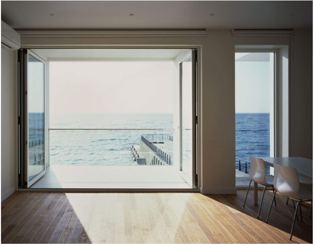
View of the sea from one of the residential units.

"The client initially required winter storage space for his 13 meter (43-foot) yacht. The client later decided to add three rental apartments and captain's accommodation to make the most of the site. A significant challenge was how to design the building so that the apartments were not overpowered by the massive door required for the yacht. Other challenges were presented by a steeply sloping site in a seismically active area, and its proximity to the sea which in bad weather could drench the house in corrosive salt water." – Robin Monotti Architects