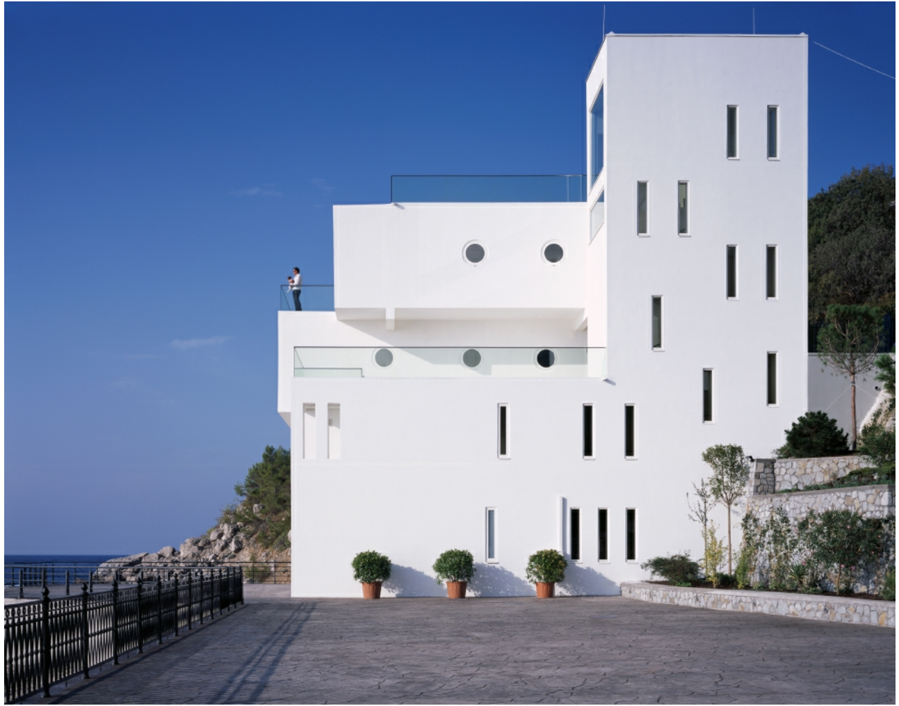
Side view.